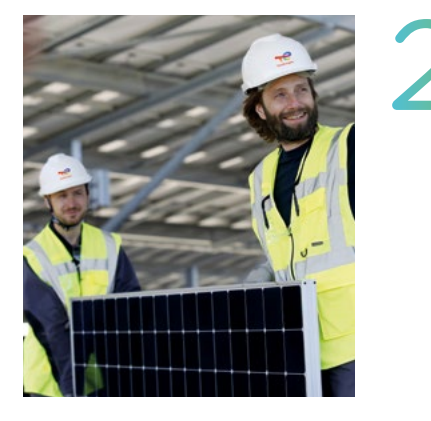
The Code of Conduct & Our Employees P.18 - P.21